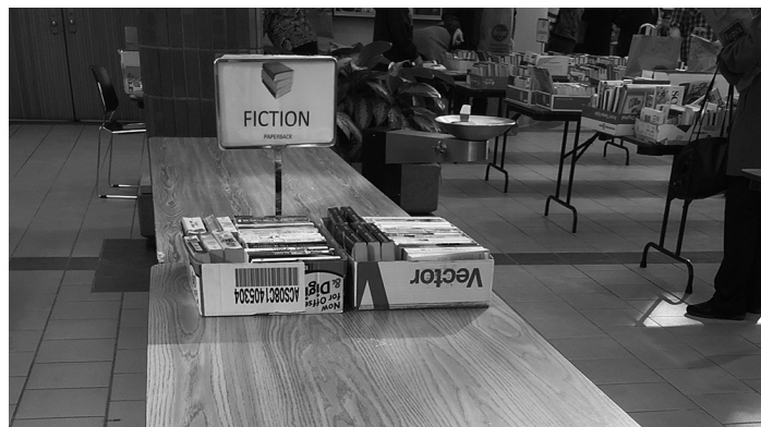
The Paperback Fiction table was popular among shoppers at the February Sale. This is what was left about an hour and a half after the doors opened on Sunday!